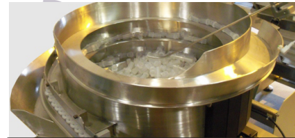
Vibratory Bowl shown here with Bulk Cap Elevator

APACKS' Centrifugal Cap-Sorting Bowl is also a great solution for high speed sorting and noise reduction for both flat, non-flat and specialty caps.