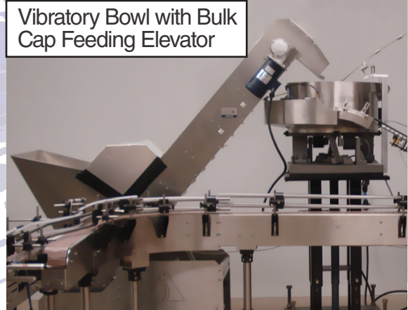
Vibratory Bowl with Bulk Cap Feeding Elevator

Our Bulk Cap Feeding Blower is a great alternative when space is at a minimum, but high bulk capacity or ergonomics is required. Bulk caps can be loaded remotely (wherever the bulk hopper is located) and transferred considerable distances to a Capping System.