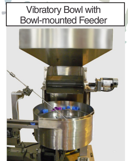
Vibratory Bowl with Bowl-mounted Feeder